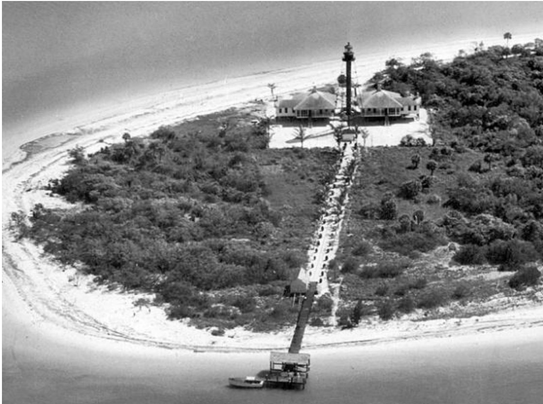
1941 Aerial View