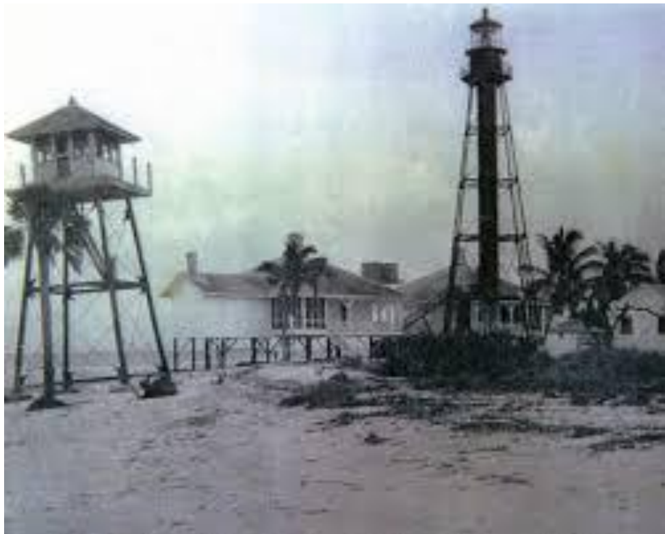
1949 Lighthouse & Submarine Tower