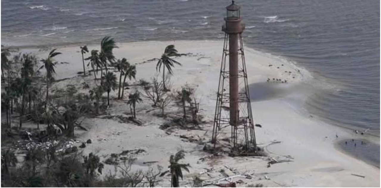
Post Hurricane Ian 2022