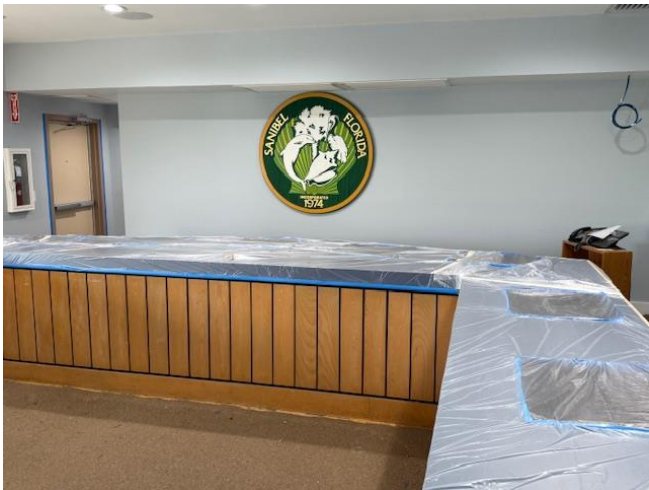
Painted Walls with City Seal