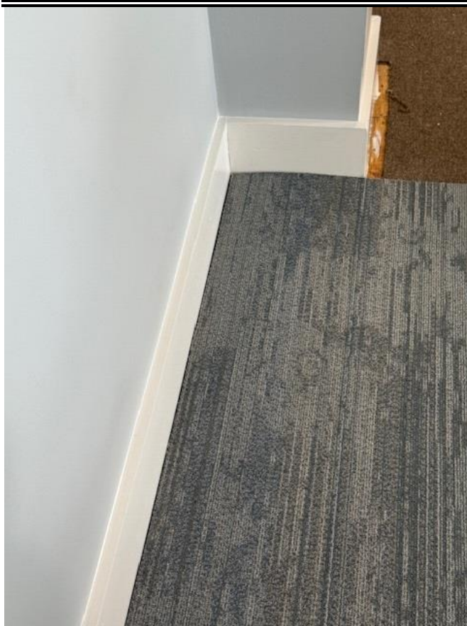
New Carpet against Painted Wall