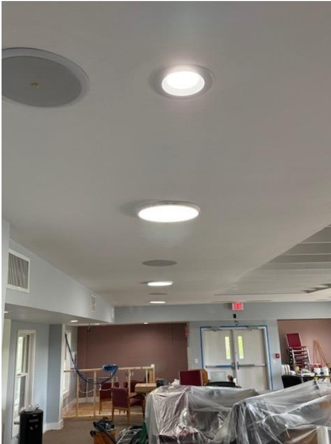
New LED Lighting

Photos of the work described above are inserted below.