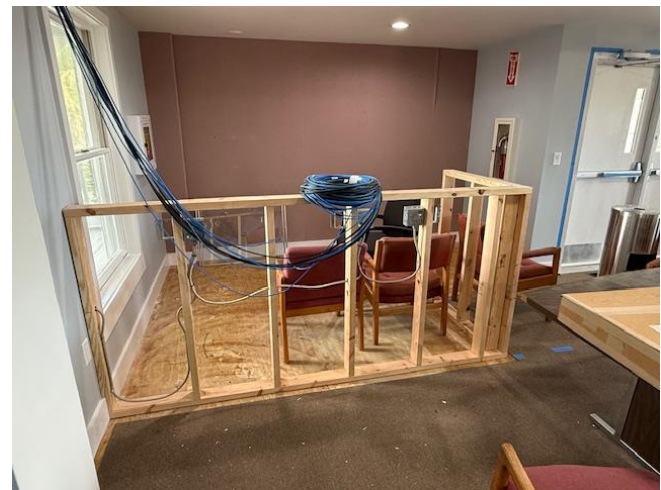
IT/AV Control Area – Back of Room

Sanibel is and shall remain a barrier island sanctuary