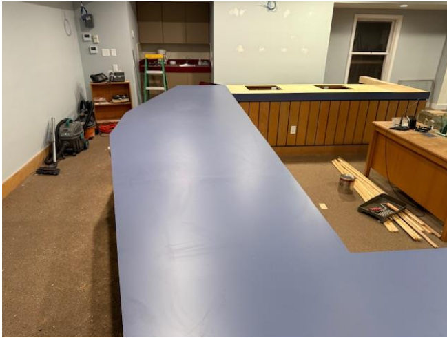
New Dais Laminate