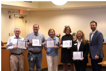
FLC Recognizes 2025 Home Rule Heroes