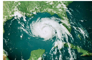
Florida Cities Ramp Up Preparedness Ahead of 2025 Hurricane Season

Want to see your city featured here? Share your stories with us!