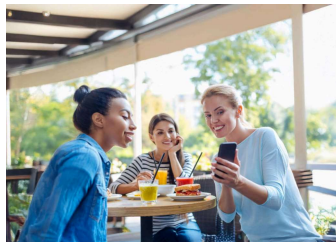
Tamarac Wins Silver Telly Award for Local Business Video