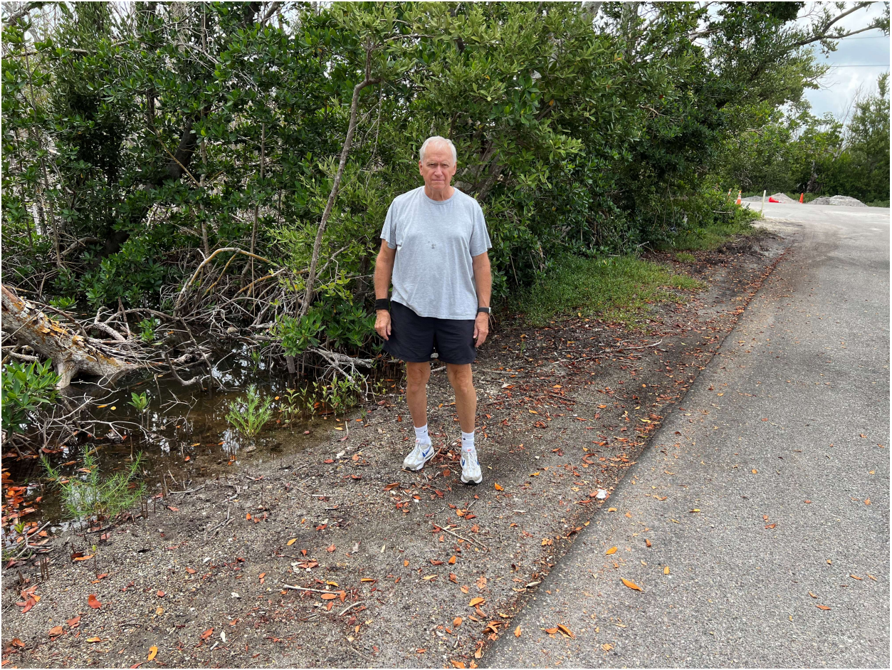
SCCF preserve between Royal Poinciana and Bailey that proposed pathway construction would deface.