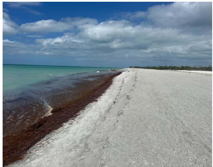
Clam Bayou/Silver Key—March 30, 2026