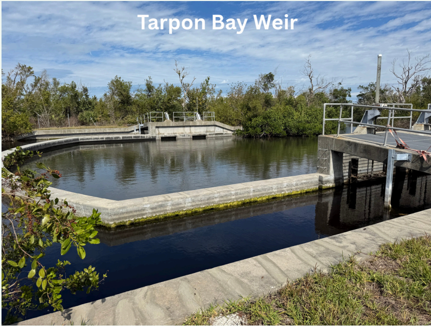
Tarpon Bay Weir