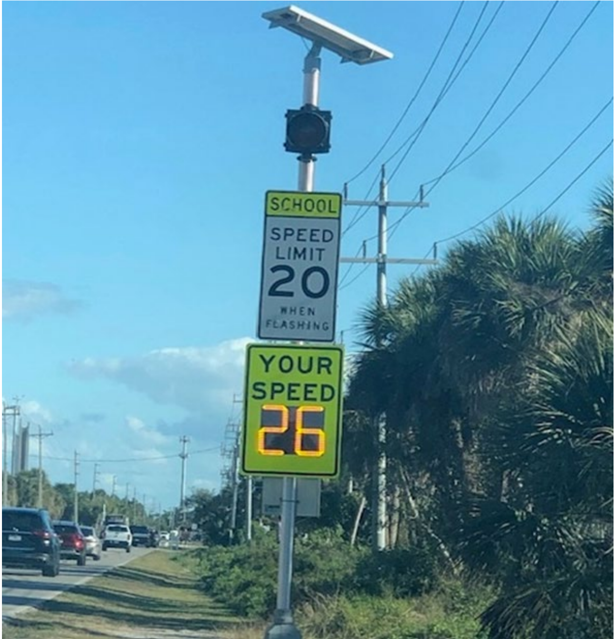
Light, Sign, and Electronic sign for Southbound Traffic at 3800 Block Sanibel Captiva Road