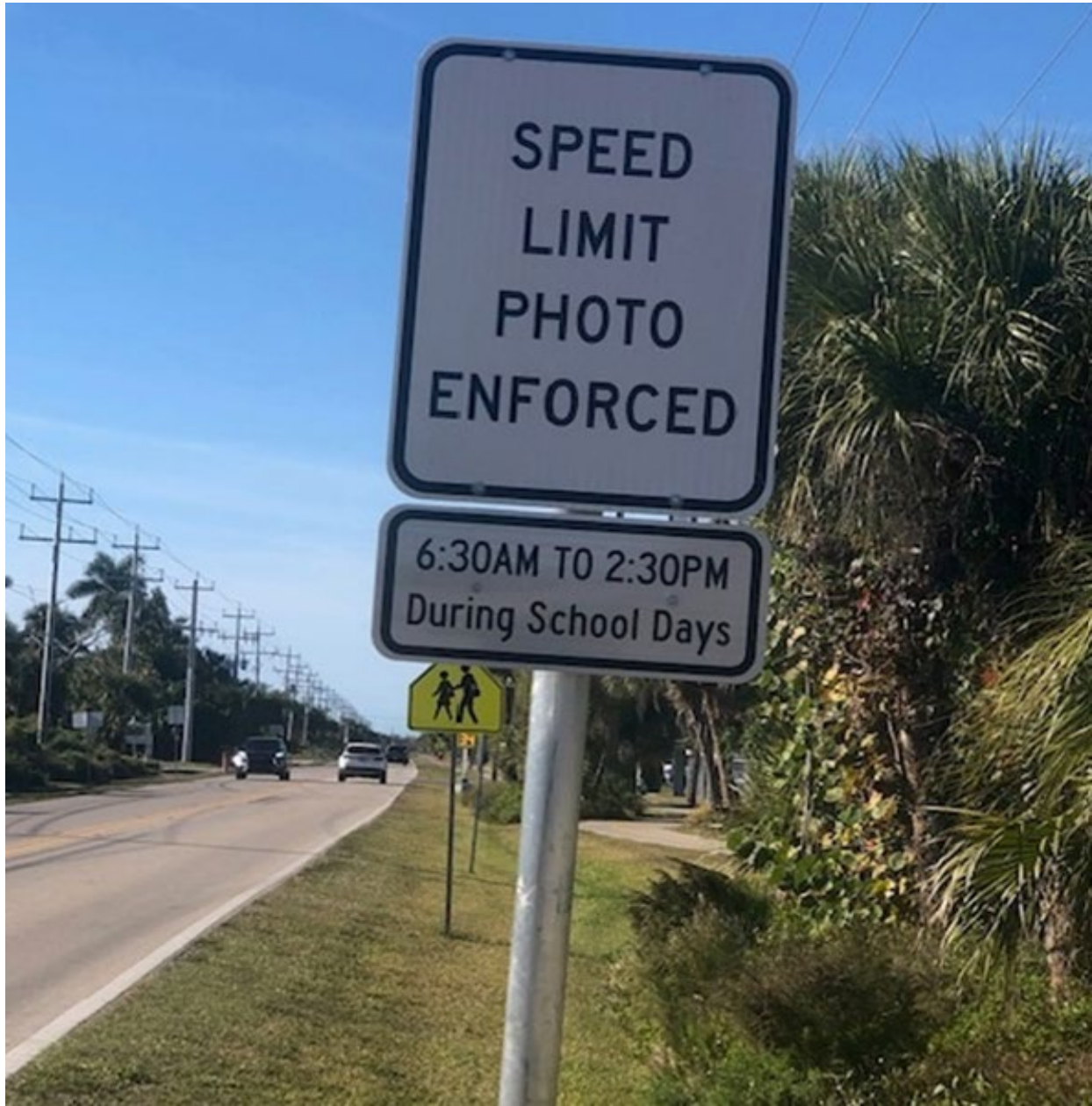
Sign notifying traffic of Photo Enforcement for Northbound Traffic at 4100 Block Sanibel Captiva Road