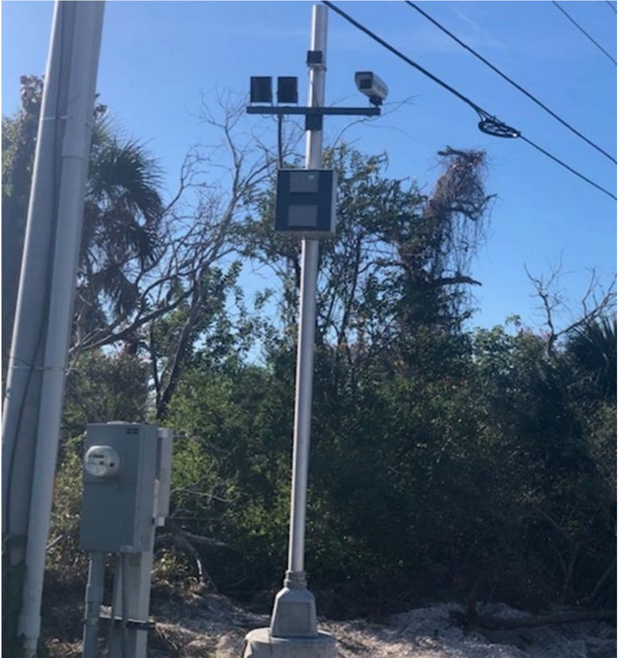
Radar unit and camera capturing Southbound Traffic at 3800 Block Sanibel Captiva Road