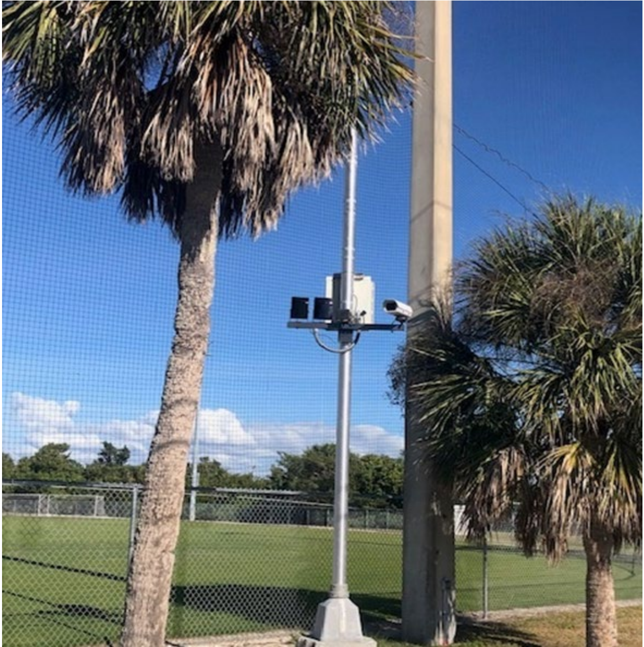
Radar unit and camera capturing Northbound Traffic at 4100 Block Sanibel Captiva Road