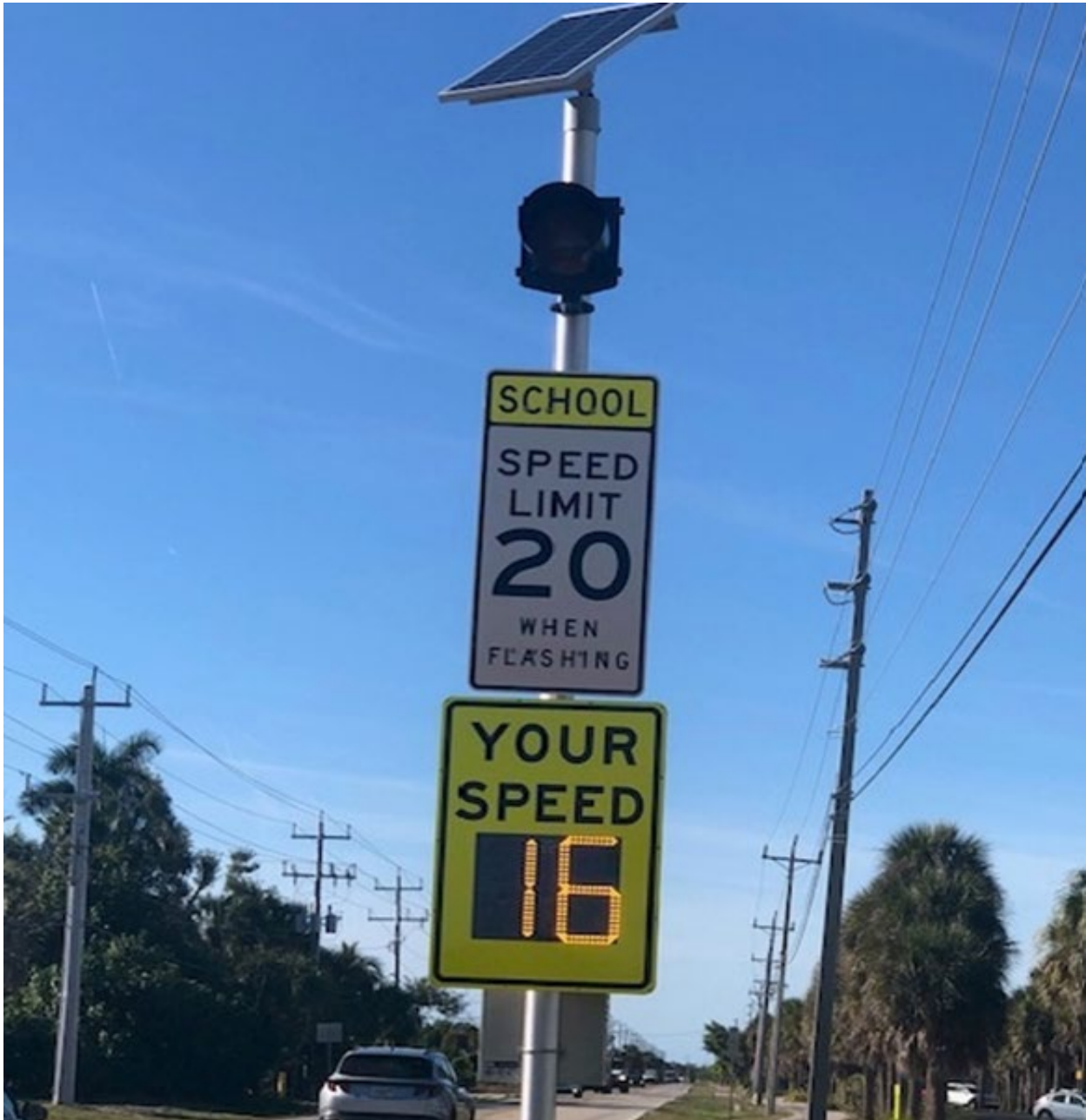
Light, Sign, and Electronic sign for Northbound Traffic at 4100 Block Sanibel Captiva Road