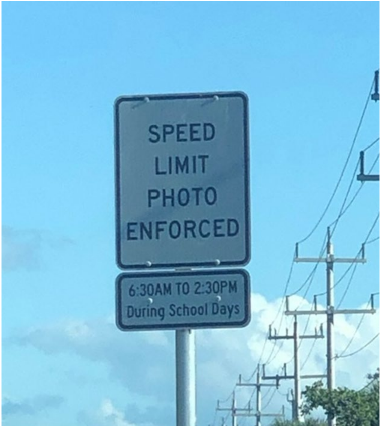
Sign notifying traffic of Photo Enforcement for Southbound Traffic at 3800 Block Sanibel Captiva Road