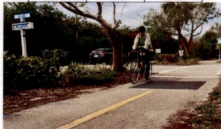
8-Foot Shared Use Path along Sanibel Captiva Road at Wild Lime Drive