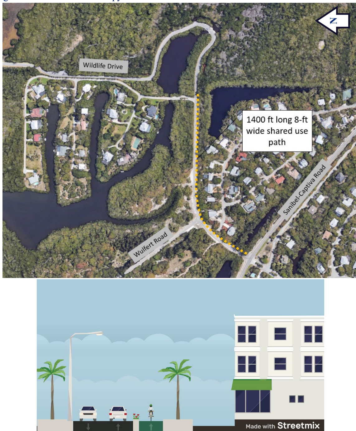
Figure 35. Shared-Use Path Connectivity Alternative for Wildlife Drive Map and Cross Section

through wetlands (see memo in Appendix B). Similar to the path for the Tarpon Bay Road site, it is recommended that the portion of multi-use path within wetlands be constructed as a boardwalk. It is also recommended to refresh centerline pavement markings. To address speeding along this segment, it is recommended that speed humps be installed on both sides ahead of the horizontal curve. Lastly, tree trimming to minimize the tree canopy over the road which creates shadows on the vehicles and cyclists.